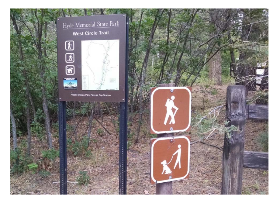
RTP-funded trail at Hyde Memorial State Park